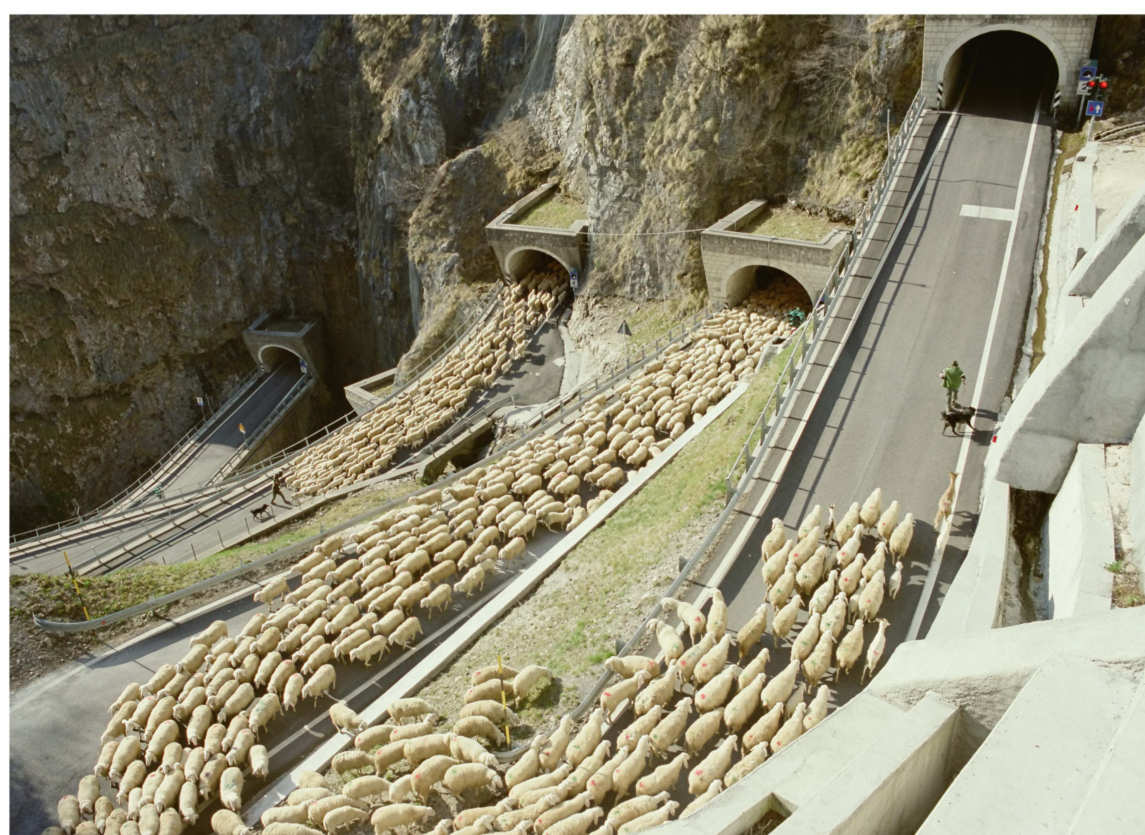
Un giorno lungo un anno - Giancarlo Rado

In this picture we pass from a barrier seen from a few centimetres to a huge one seen from the top of a mountain, a urban settlement in a valley. The night makes it very visible and allows to “appreciate” its impermeability. The peaks are dark, which stands for the presence of an environment that still allows the free movement of species. Econnect wants to preserve this “dark” and, at the same time, wants to restore the “illuminated” part to make it permeable for wildlife.