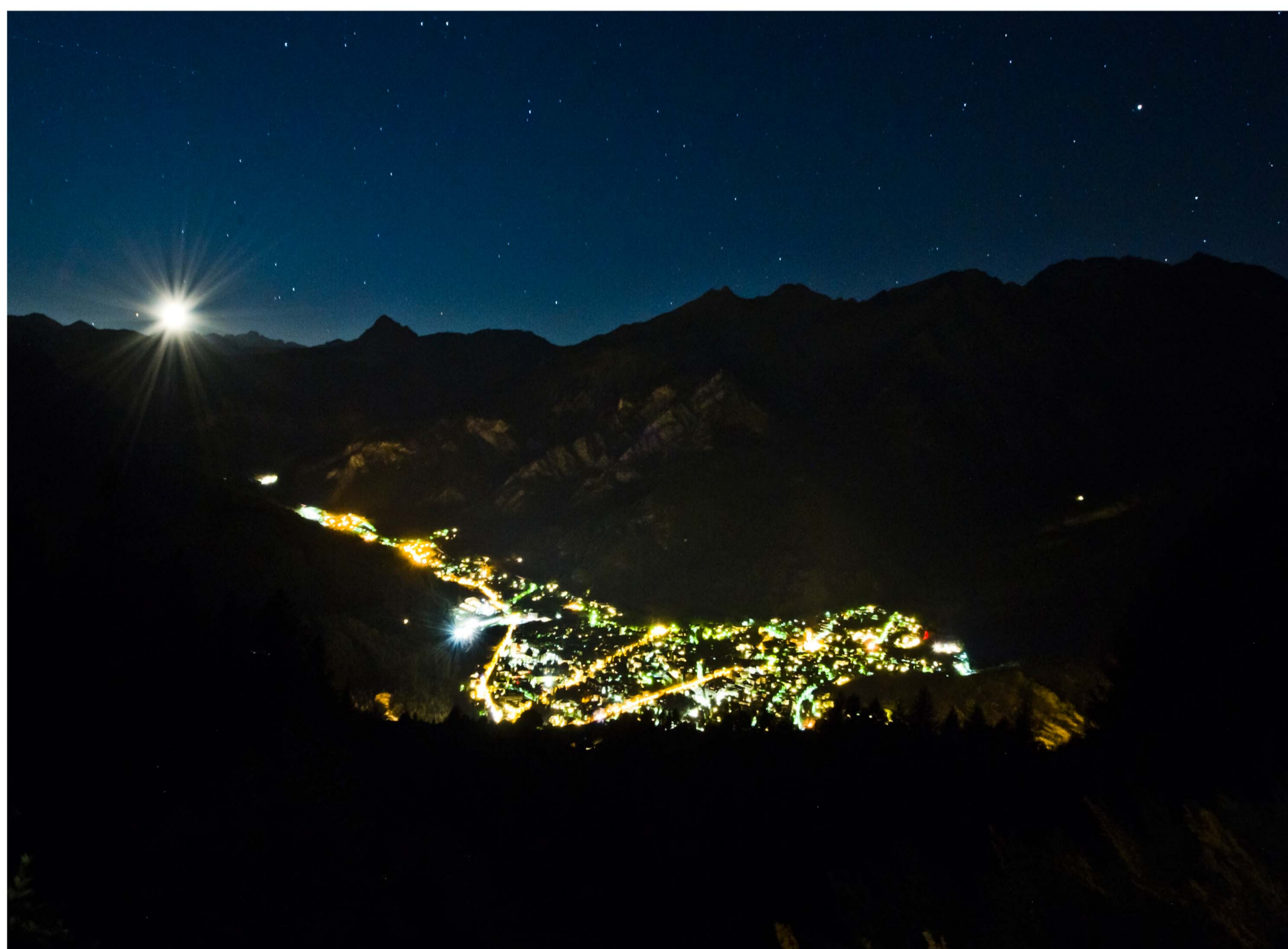
Bardonite - Giorgio Violino

The picture puts the viewer a few centimetres from an iron-fence and makes him feel like trapped. The fact that the fence is out of focus suggests that the gaze is headed to the mountains, toward what we would like to reach but we are prevented from.